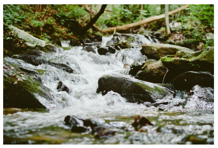
Possible Photograph of Aquatic Biome

Project a photograph of a nearby aquatic biome, like what is represented below. Then encourage students to think about the different types of matter and energy that flow within the biome. As students provide ideas, make a list that can be seen by the entire class. Encourage students to consider both non-living (e.g., freshwater, sunlight, rocks) and living things at various scales (e.g., algae, mosses, ferns, insect larvae, flying insects, salamanders, and trout).