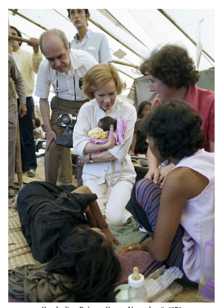
Cambodian Refugee Camp, November 9, 1979