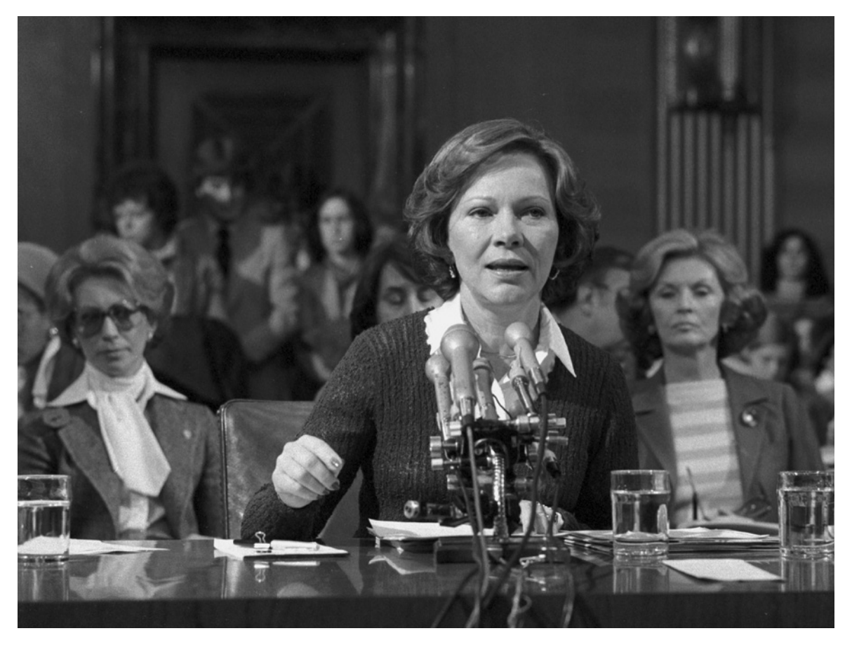
Testifying Before Congress on Mental Health, February 7, 1979

"I want people to know what I know—that today because of research and our knowledge of the brain, mental illnesses can be diagnosed and treated effectively, and the majority of those with these conditions can recover and lead fulfilling lives...going to school, working, raising a family, and being productive citizens in their communities."