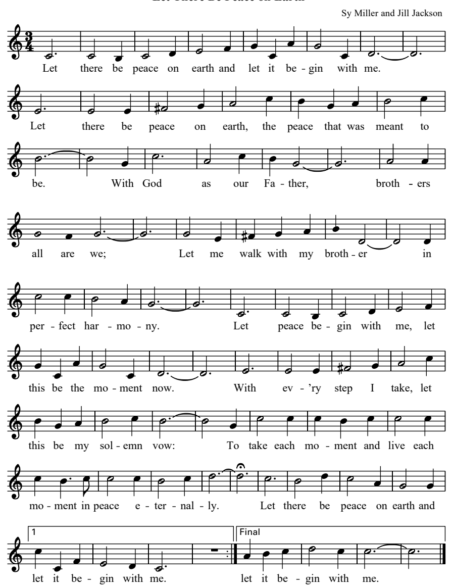
Copyright © 1955, renewed 1983 by Jan-Lee Music (ASCAP). All rights reserved. Reprinted with permission. International copyright secured.