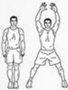
10 jumping jacks