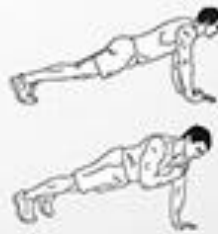
4 shoulder taps