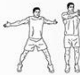
10 seal jacks