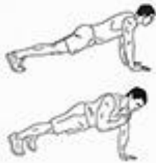
4 shoulder taps