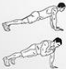
4 shoulder taps