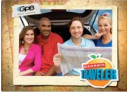
The Georgia Traveler Crew